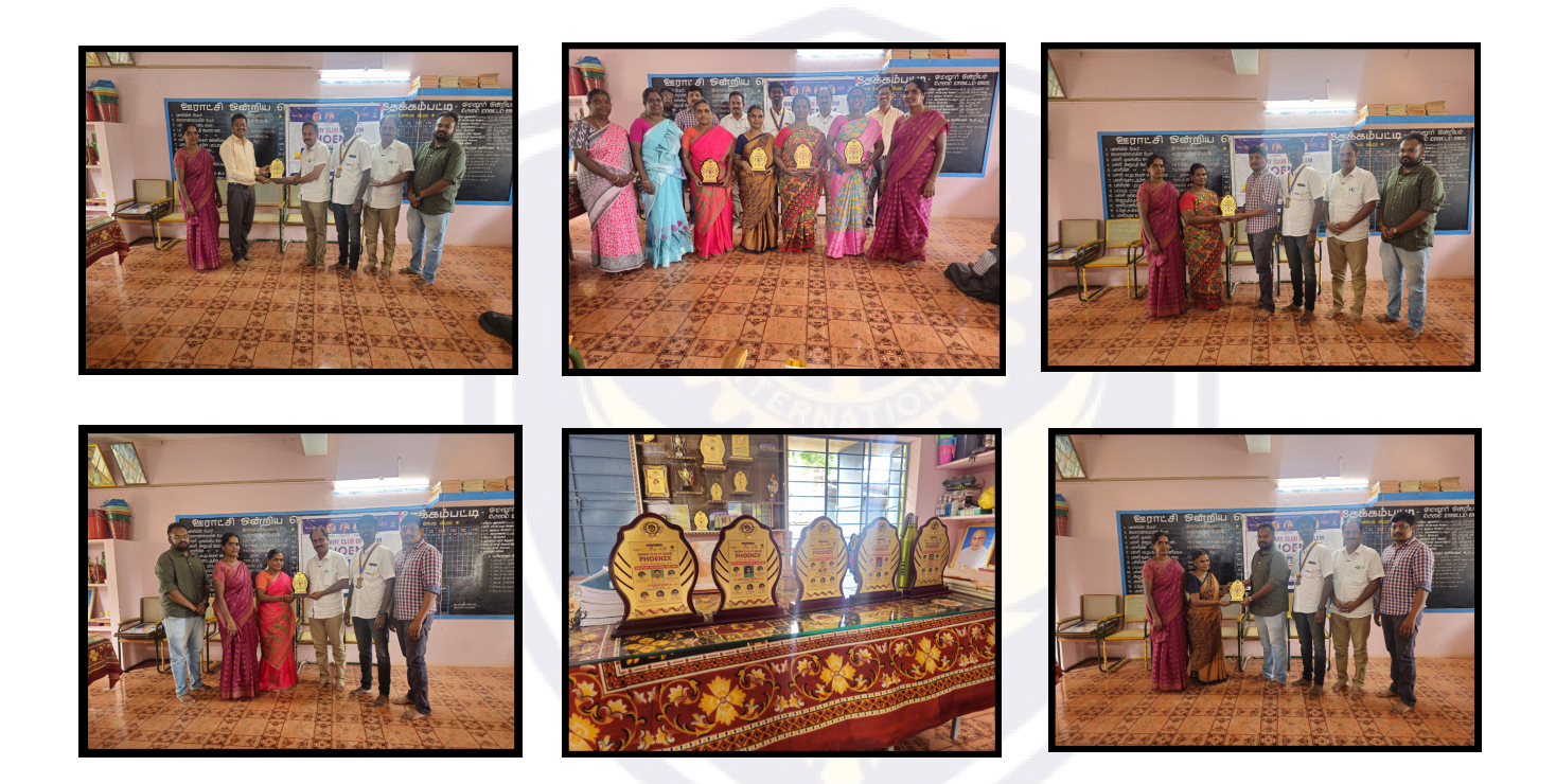
Project Date: 06 September 2024 Project Venue: Govt Hr. Sec School. THekkampatty, Salem.

This year we Rotary Club of Salem Phoenix added one additional school from a rural region and honored 5 teachers from the school. This school is located in a more rural area of Salem Town, and although having over 500 pupils enrolled, it is not well-known in the community. In order to reward the instructors for their dedication to the school and students, we at RC Phoenix drilled it out and recognised them as Nation Builders.