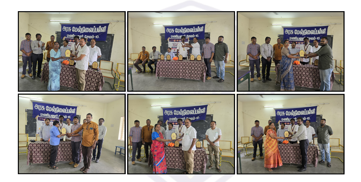
Project Date: 05 September 2024 Project Venue: Govt Hr. Sec School. Maniyanoor, Salem.

Every year, Rotary Club of Salem Phoenix recognises and awards the top instructors from Govt. Higher Secondary School in Maniyanoor. This year, we recognised and gave awards to five teachers who worked hard to ensure that all of their students passed their board examinations. The instructors were overjoyed to receive the Nation Builder Award.