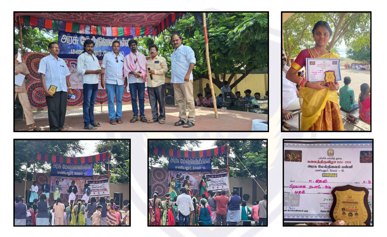
Project Date: 09 September 2024 Project Venue: Government Hr. Sec. School. Maniyanoor, Salem.

In order to showcase the abilities of government school kids, our Phoenix club collaborated with the Tamilnadu government to organise a massive "Kalai Thiruvihza." Students performed in front of the audience on stage, showcasing their speech, dancing, singing, and other special abilities.